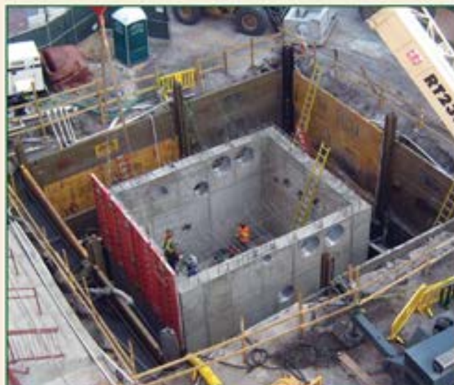
Slide Rail System