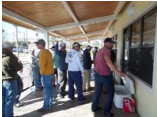
Anglers gather as teams bring in their haul for the day.