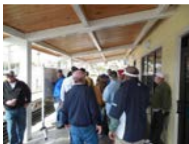
The anglers gather around the scoreboard on Day One.