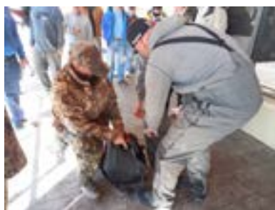
Team 9 struggles against 27 pounds of live bass.