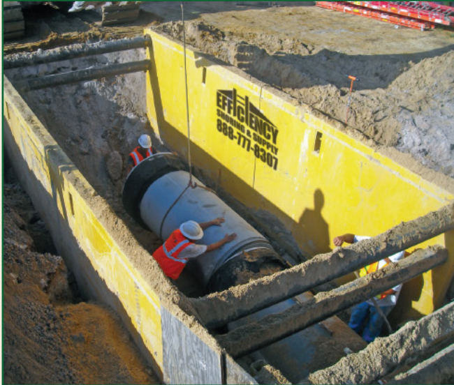
Steel Trench Shields