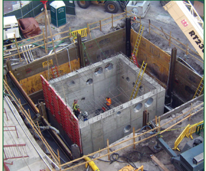
Slide Rail System