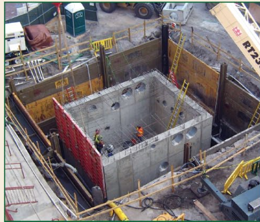
Slide Rail System