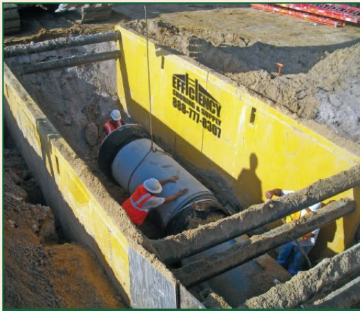
Steel Trench Shields