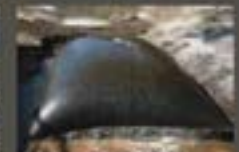
Dewatering Bags for containment of filtered sediment