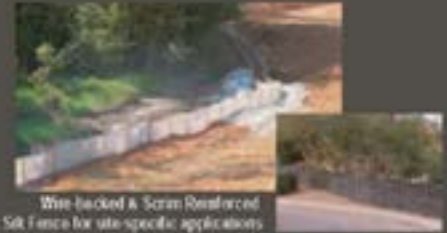
Wire-backed & Geotextile Reinforced Silt Fence for site-specific applications