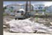
Site Access Matting for construction entrances and sensitive areas