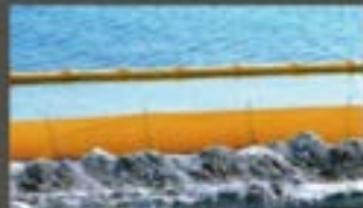
Floating & Staked Turbidity Barriers for controlling sediment transport in waterways, streams & creeks