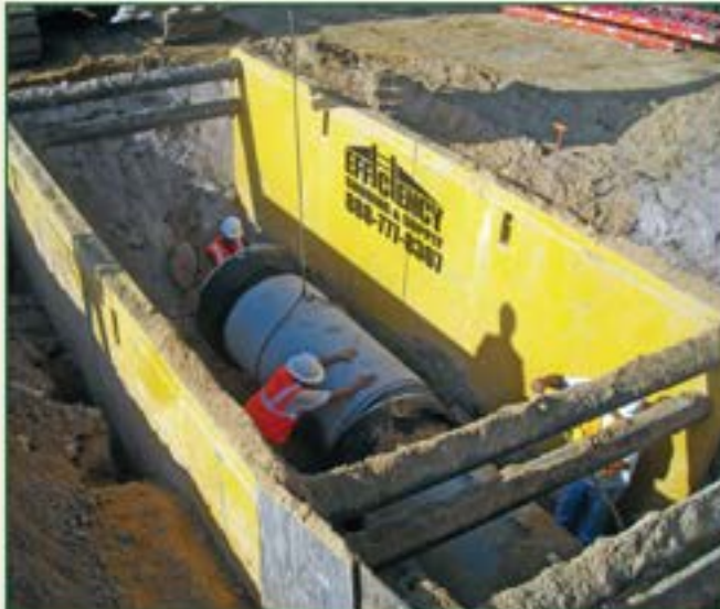
Steel Trench Shields