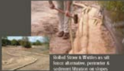
Roll of Straw & Wattles as silt fence alternative, perimeter & sediment filtration on slopes

Erosion and pollution control practices employed during construction to protect surface waters and wetlands from construction activities