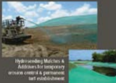
Hydroseeding Mulches & Additives for temporary erosion control & permanent land establishment