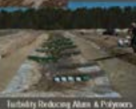
Turbidity Reducing Mats & Polyfences