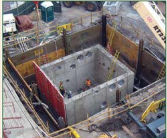
Slide Rail System