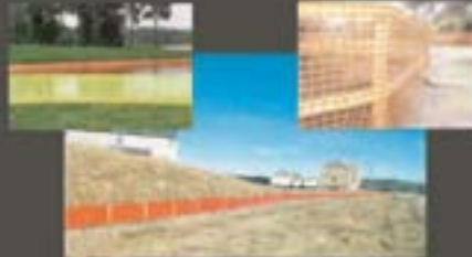
Orange & Green Durable Safety Fence for high visibility perimeter control & tree barricades