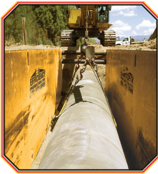
steel trench shield