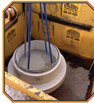
slide rail system