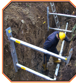
hydraulic vertical shores