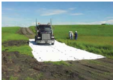
CROSSING SENSITIVE AREAS