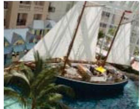
Key West Atrium