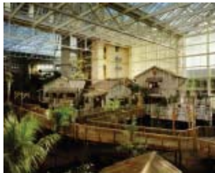
Old Hickory Atrium