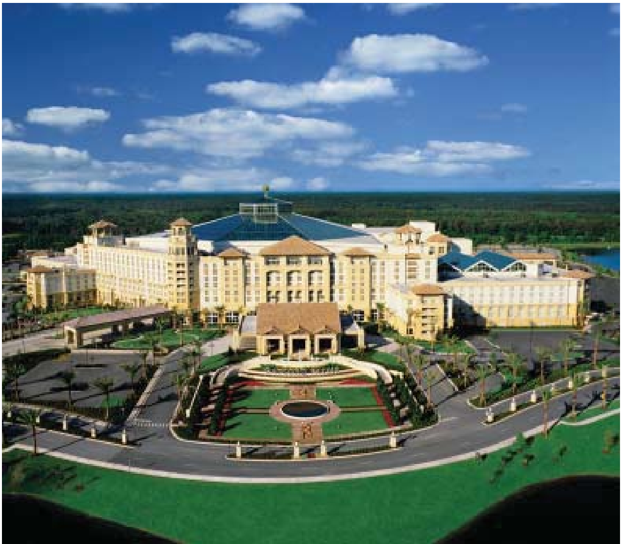
Gaylord Palms Resort & Convention Center Kissimmee, Florida