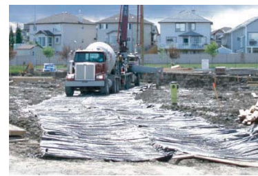
ALTERNATIVE TO ROCK ENTRANCES