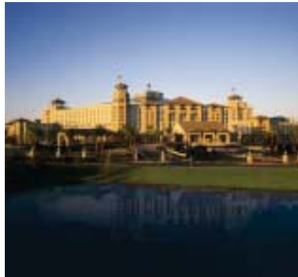
Outside of resort

We hope to see you all at the UUCF 2010 Convention at the Gaylord Palms Resort & Convention Center in Kissimmee on July 23–25, 2010!