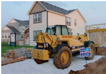
RESIDENTIAL CONSTRUCTION ENTRANCE

A NEW revolutionary product to keep you out of the mud!