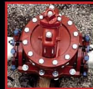
InsertValve™ with bonnet ring bolted in place, install complete.

The Gate seats against the valve body NOT against the pipe! Proudly made in the U.S.A.