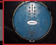
24" Folding Head Line Stop