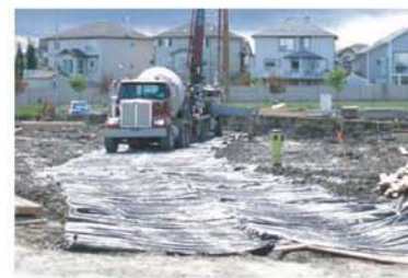
ALTERNATIVE TO ROCK ENTRANCES