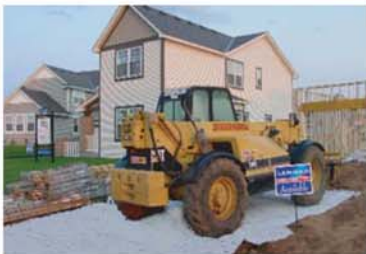
RESIDENTIAL CONSTRUCTION ENTRANCE

A NEW revolutionary product to keep you out of the mud!