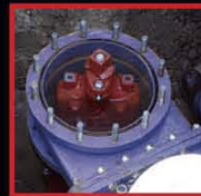
Bonnet & Gate installed in valve body, insert tool removed