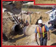
36" Line Stop and Pipe Cutting

LINE STOPS RANGELINE offers small and large diameter line stops and we stock line stop fittings for your emergency needs.