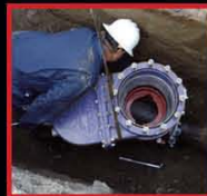
Occlude isolation valve bolted in place

RANGELINE offers 6" & 8" 4" & 12" Coming Soon!