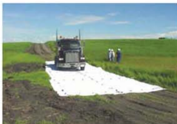
CROSSING SENSITIVE AREAS