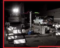
Single 24" Emergency Line Stop at midnight.