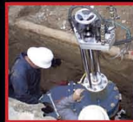
Tapping machine installed